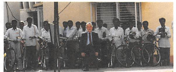
DISTRIBUTING NEW BICYCLES