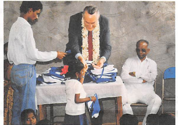
NEW CLOTHES FOR A LITTLE GIRL