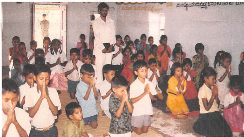
THE PRAYER OF ORPHANS. THE PASTOR WAS FORMERLY AN ORPHAN.